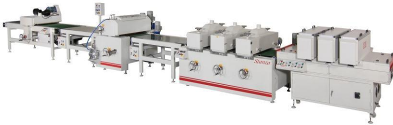
Rollcoat lines for Flooring, Drawer Parts and Panels