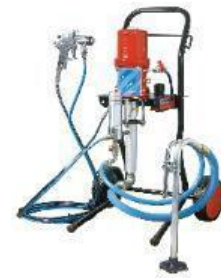
Spray Systems and Accessories