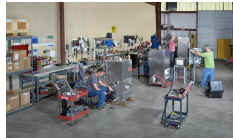
Vacuum Coaters being manufactured in Charlotte, NC