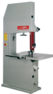
Cantek HB600 24" Band Resaw