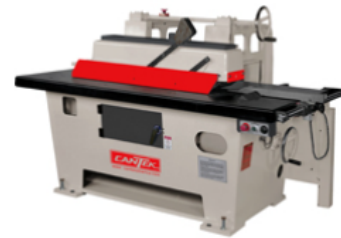
Cantek R18 Heavy Duty Straight Line Ripsaw