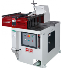
Cantek PCS-24 Cutoff Saws

Some of the machinery types available from Leadermac/Cantek: