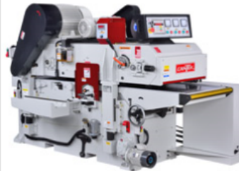
Cantek GT760ARD 30" Double Surface Planer