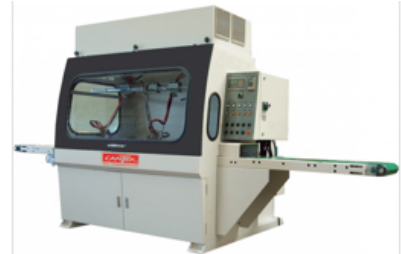
Cantek CD-305 Linear Spray Machine