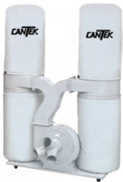
Cantek UFO-102B 3HP Dust Collector