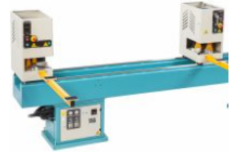
WELDING AND CORNER CLEANING MACHINES