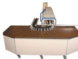
VINYL (PVC) PROFILE BENDING