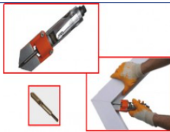
PVC CORNER CLEANING TOOLS