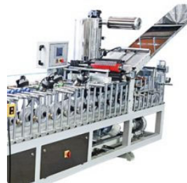
WRAPPING & LAMINATION MACHINES