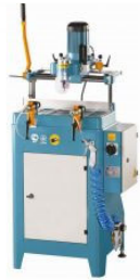
COPY ROUTING MACHINES