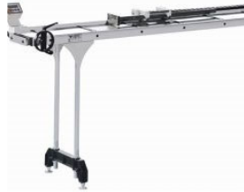
INFEED & OUTFEED TABLES