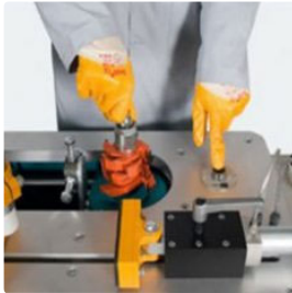
END MILLING MACHINES